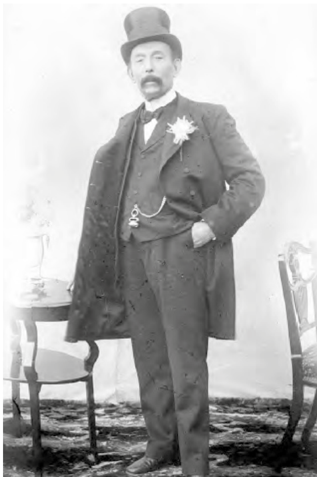
THE LATE LORD GEORGE SANGER President 1900 - 1908