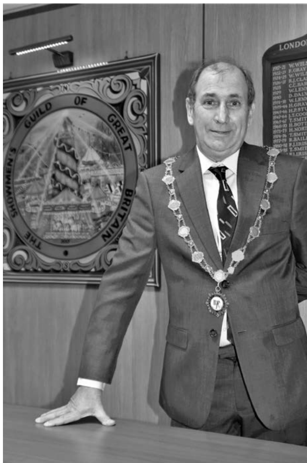
DONALD GRAY National Sergeant-at-Arms