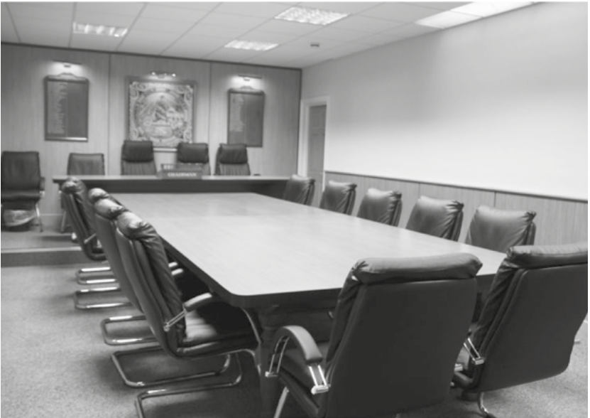
GUILD HOUSE BOARDROOM